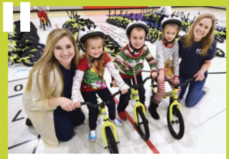
MedExpress Donates 110 Bikes to Area Schools